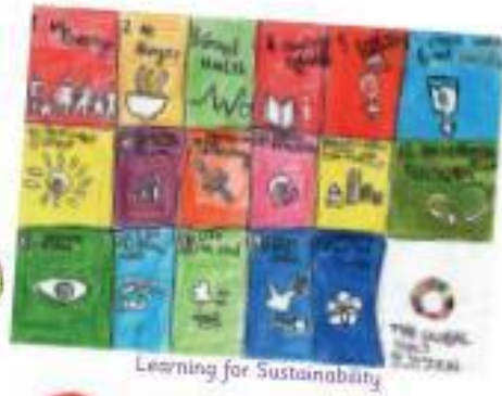
Learning for Sustainability