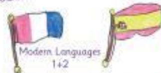
Modern Languages 1+2