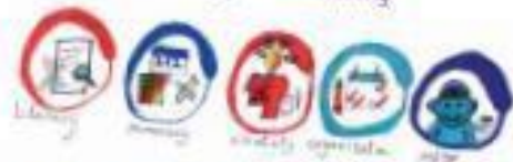
Skills for Life and Learning