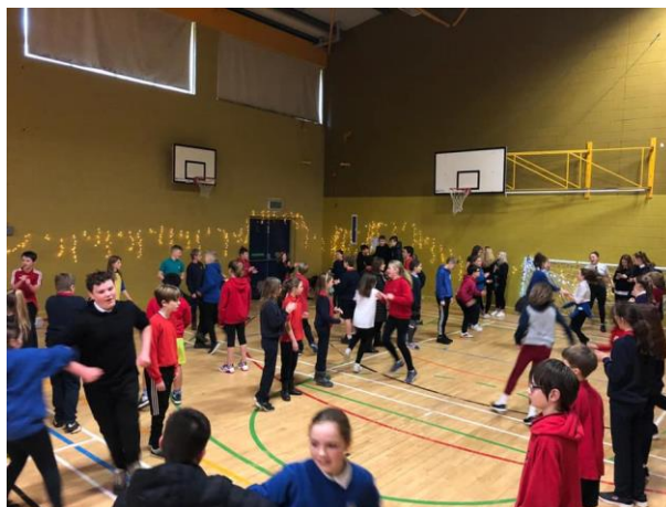
[P7 Transition Ceilidh- December 2019]