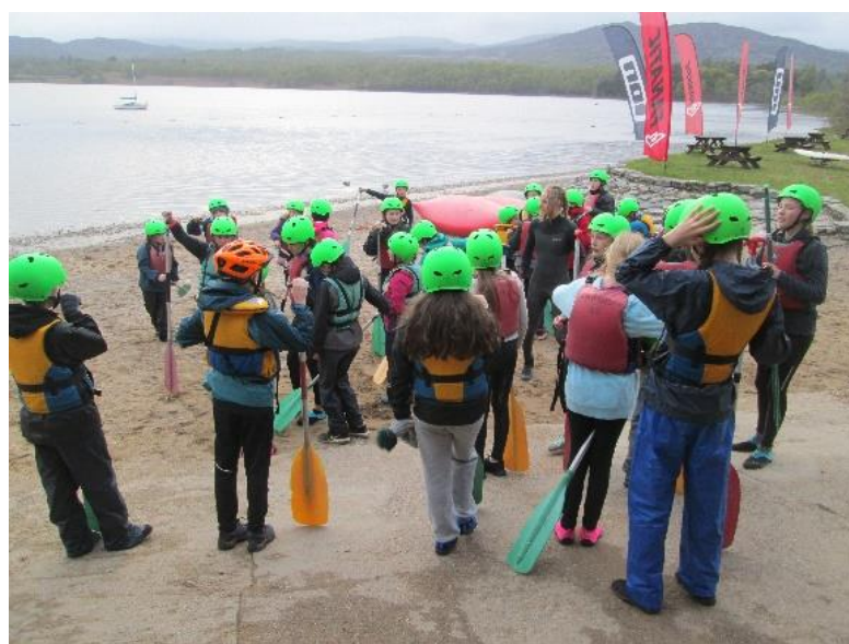
[P7 enjoy our Residential trip at Loch Insh 2019]

The P6/7 pupils take on Leadership training each year. The pupils lead the decisions for the year and are responsible for improving the school and wider community.