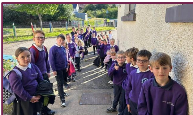
Our first all-together Thursday of session 2023-24

The number is: 08000 28 22 33 or email: parentlinescotland@children1st.org.uk