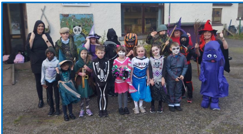
Halloween Fun 2023

Our First Aider will only deal with minor cuts and bruises, these will be cleaned and a plaster applied. Anything more serious will be referred to the local GP and parents informed. If your child is injured, falls or becomes unwell during the school day you or the emergency contact you have provided, will always be contacted and you may be advised to collect your child from school.