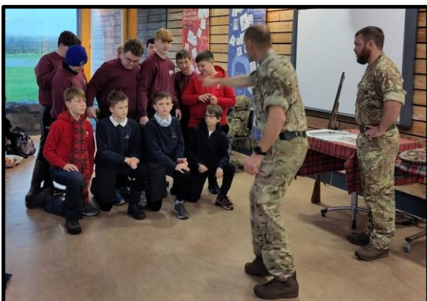
The P7s join the S1-3 pupils on a guided tour of Culloden Battlefield November 2023

Parents are encouraged to contact the school if there are ever any issues that need to be discussed. Parents can phone the school and speak to the clerical assistant, teachers or the head teacher. The Seesaw app is used across our ASG to share learning from school with families. Your child's class teacher will supply you with the required details to access the correct classroom. Families enjoy being able to ask children at home about the photos & pieces of work that teachers have uploaded.