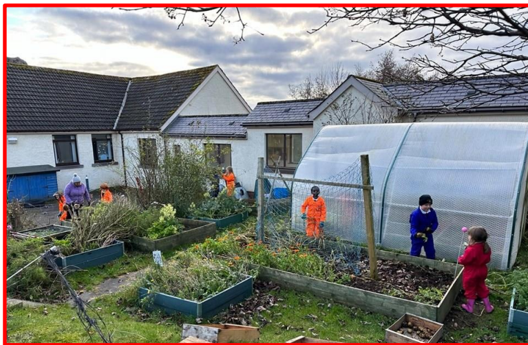
P1-3 Harvesting School Grown Tatties