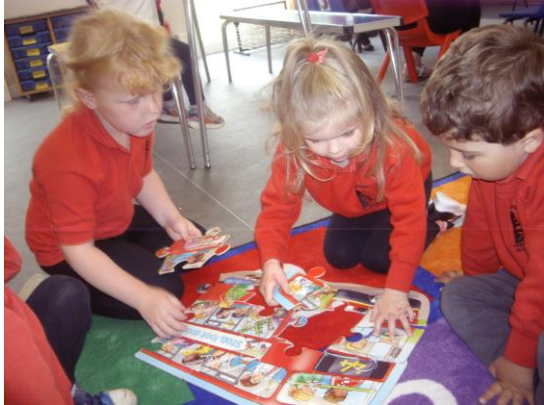
The children are becoming effective contributors. Some are working hard to complete a jigsaw. Others are having fun outdoors.

Effective Contributors who find trying new things exciting and keep trying even when things are difficult. They will be able to work with partners and in groups and will help others. They will work out new and different ways of doing things to solve problems.