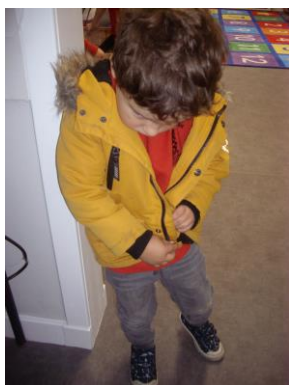
Children independently trying zips and buttons.