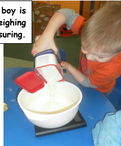
This little boy is learning about weighing and measuring.

Expressive arts: this will allow children to develop their artistic skills and enhance their creative talents. By engaging in these experiences children will develop ability to represent their own and others emotions in different ways.