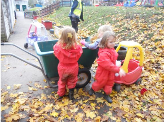
The children are being responsible citizens sharing in the Nursery garden.

Effective Contributors who find trying new things exciting and keep trying even when things are difficult. They will be able to work with partners and in groups and will help others. They will work out new and different ways of doing things to solve problems.