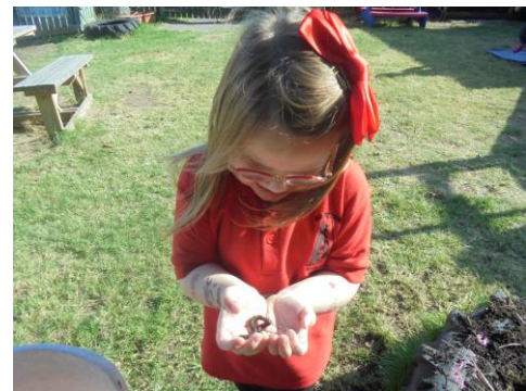
Mini beasts in our Nursery garden.

Social studies: children will develop their understanding of the world by learning about other people and their values, in different times, places and circumstances, they will