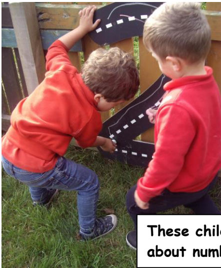
These children are learning about numbers.