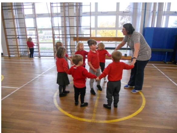
Learning to play games