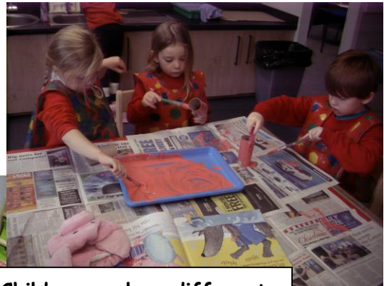
Children explore different materials in the art area.

Sciences: learning in the sciences will enable children to develop their interest in, and understanding of the living, material and physical world. They will take part in collaborative and imaginative tasks to allow them to develop important skills to become creative, inventive and enterprising people in the future.