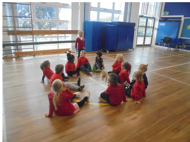
Children warming up in the school gym hall.

We regularly go on walks around the school to get to know the area and the staff. We also go out into the school playground.