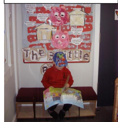
Children enjoy reading and retelling stories.