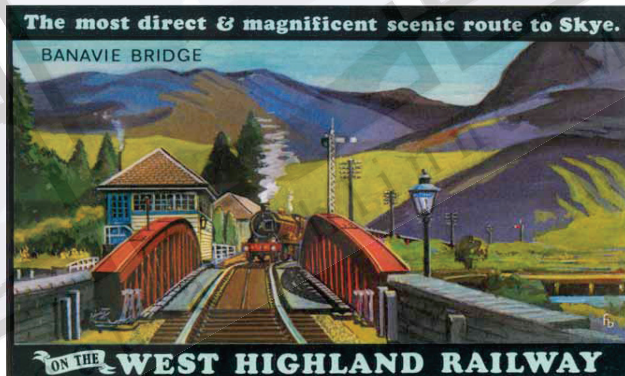
Promotional poster for the West Highland Railway.