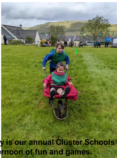
Sports Day is our annual Cluster Schools event where Carbost and Dunvegan Primary communities come together for an afternoon of fun and games.

Our Promoting Positive Relationships Policy and Anti-Bullying Policy can be accessed on our school website .