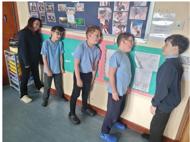
All about gravity!

Learning CPR and first aid with the ambulance crew.