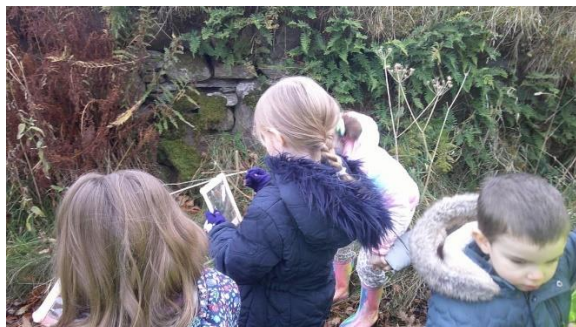
Art in the great outdoors – ELC