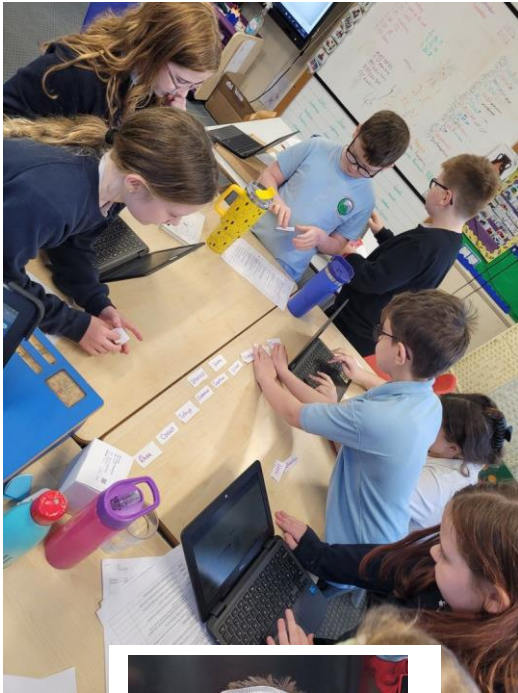
Collaborative working in P5-7 to research and create family trees of the Titans and gods in Greek Mythology.

Through many initiatives, our Eco Group, led by their reps are working hard to keep their well-earned Green Flag status. More information on either group can be seen in our school newsletters on the school website.