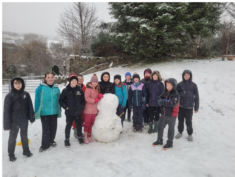
Playtime team work!