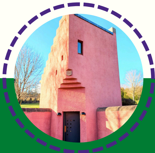
Memorial Tower at Inverness Crematorium

Our Book of Remembrance is a lasting tribute, housed within our Memorial Tower at Inverness Crematorium. This serene location offers a peaceful space for quiet reflection and remembrance.