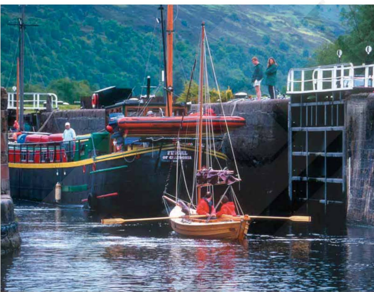
Exploring the canal by boat.

Pronounced: Falcha choon na creechya (no chonn an tosheech)