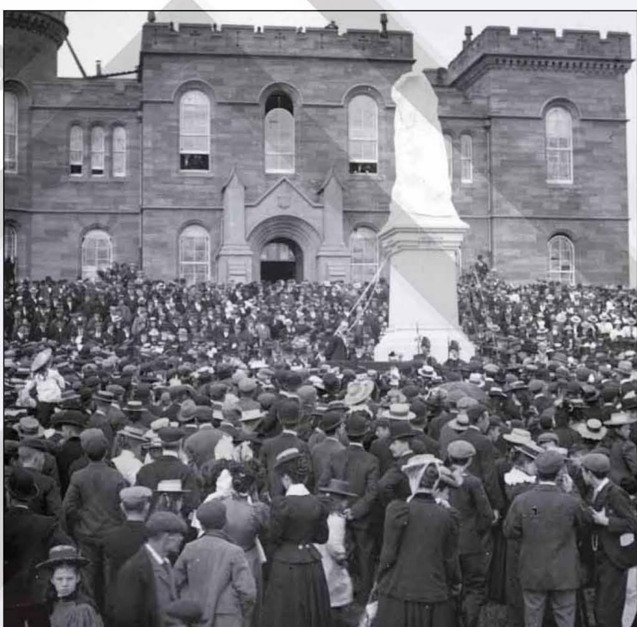
Unveiling of Flora MacDonald monument in 1899.

Whether you want to walk the whole of the route or just one short stretch, the Great Glen Way is here for you to explore and enjoy.