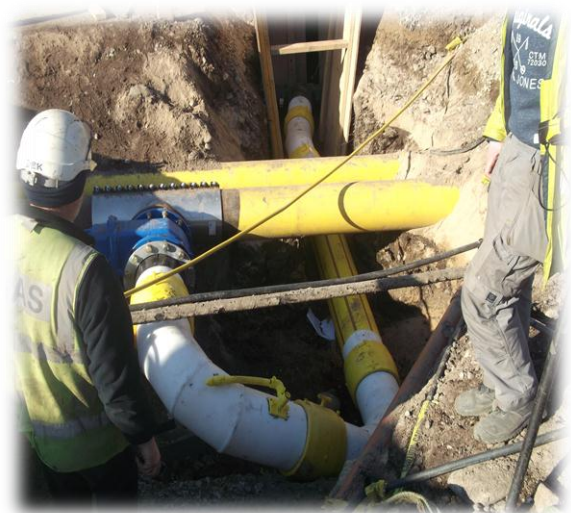
WC: 11-16<sup>th</sup> March

On Tuesday 12<sup>th</sup> March Huntly Street re-opened between Wells Street and Celt Street. Coffey Construction are currently working on the section of Huntly Street between Celt Street and Greig Street with a view to having this Section completed and re-opened to traffic on Saturday 23<sup>rd</sup> March.