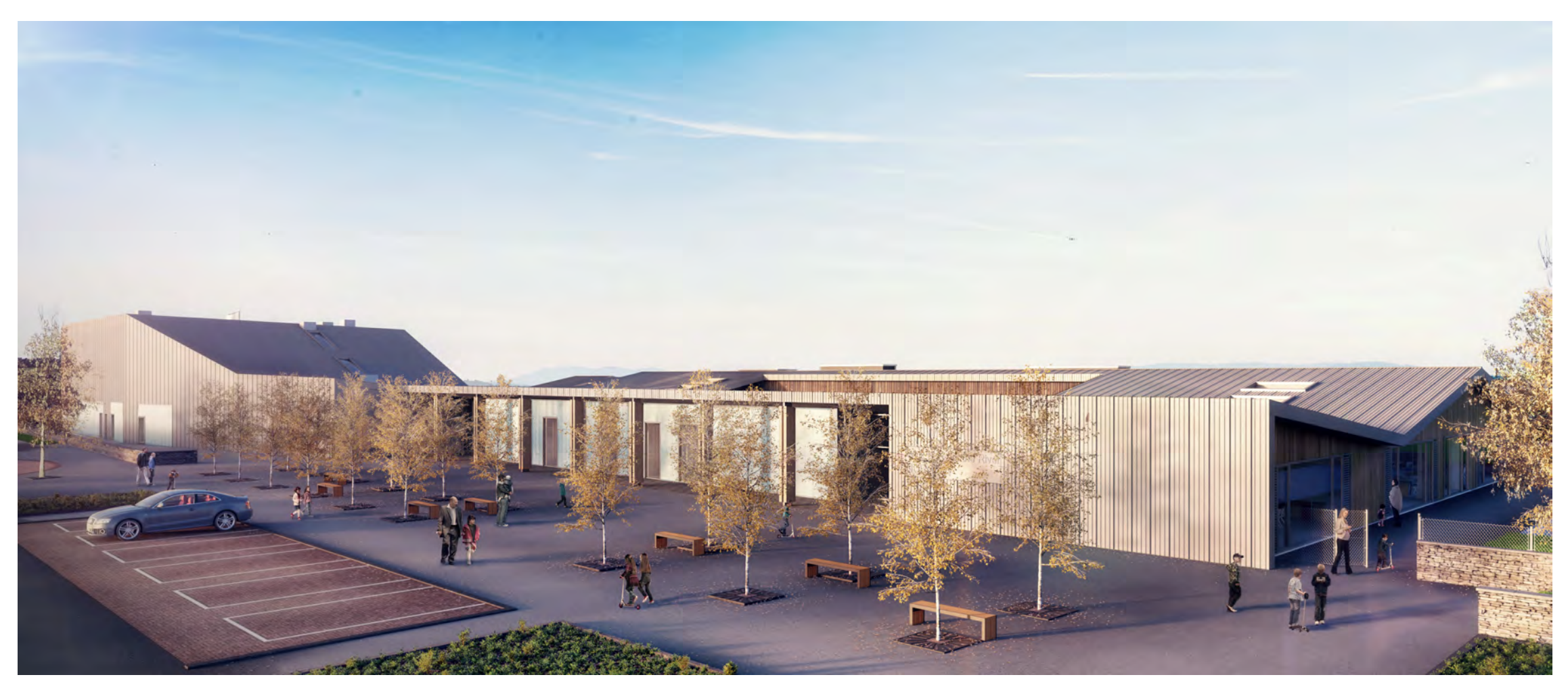
Main Entrance Approach

The use of this data by the recipient acts as an agreement of the following statements. Do not use this data if you do not agree with any of the following statements:-