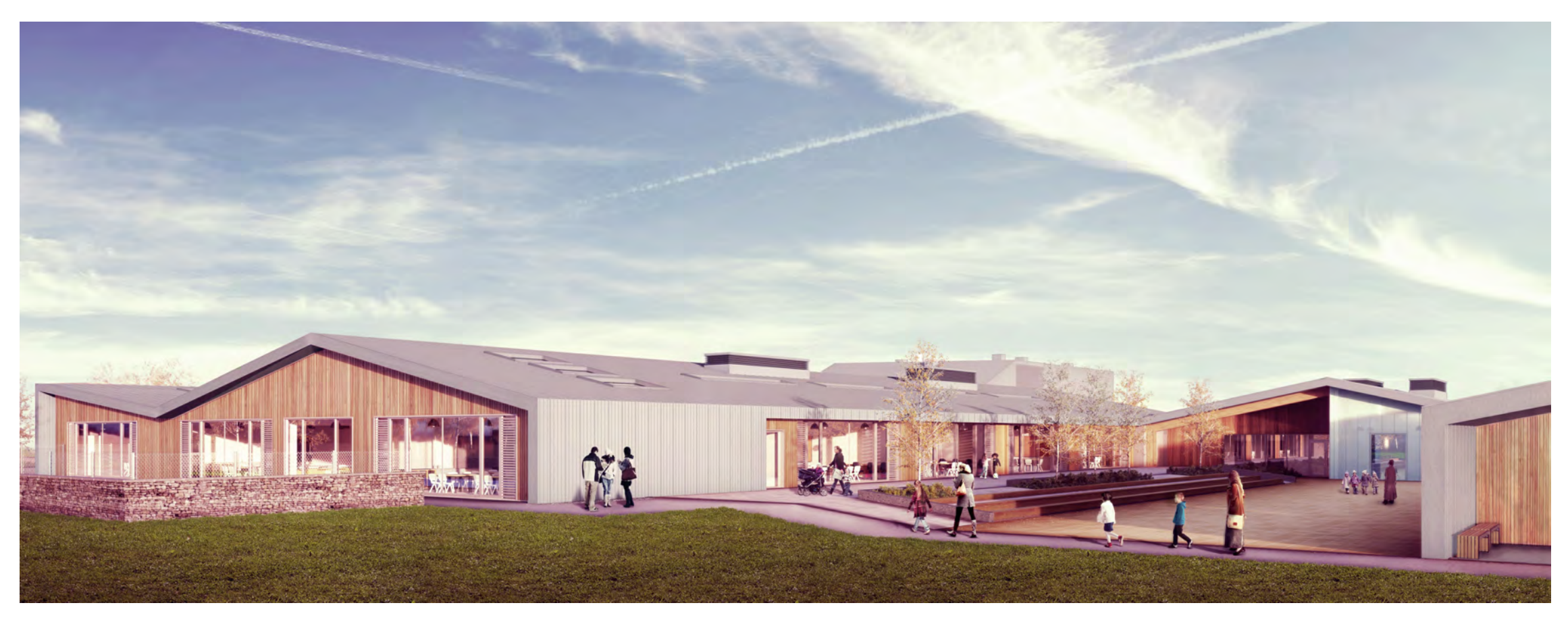
External Courtyard with Amphitheatre

The use of this data by the recipient acts as an agreement of the following statements. Do not use this data if you do not agree with any of the following statements:-