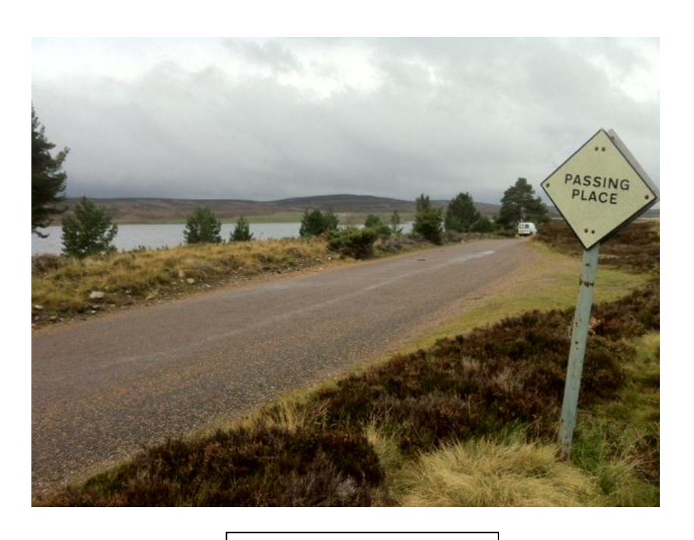
The same area in October 2013