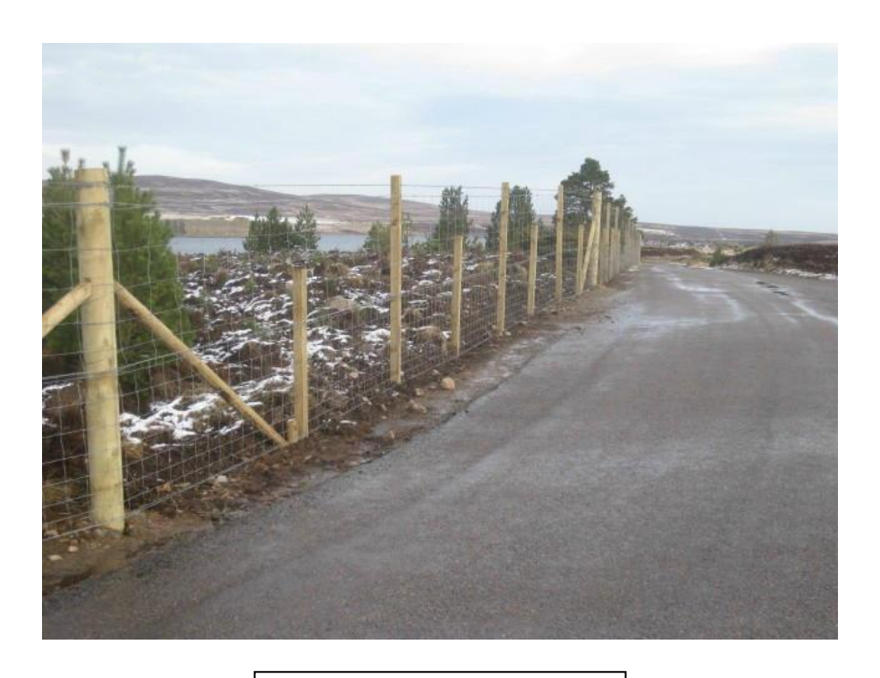
Fencing in February 2012