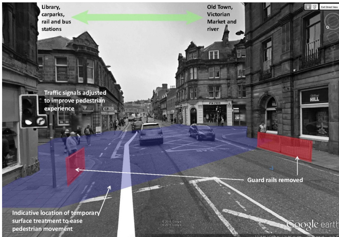
Academy Street looking south at junction with Strothers Lane (left) and Queensgate

The effectiveness of these interventions will be measured by “before” and “after” on-street observation techniques. Quantitative information such as pedestrian numbers will be gathered using mechanical tracking devices. In addition, the quality of pedestrian experience will be mapped to identify how people occupy, use and move through this junction.