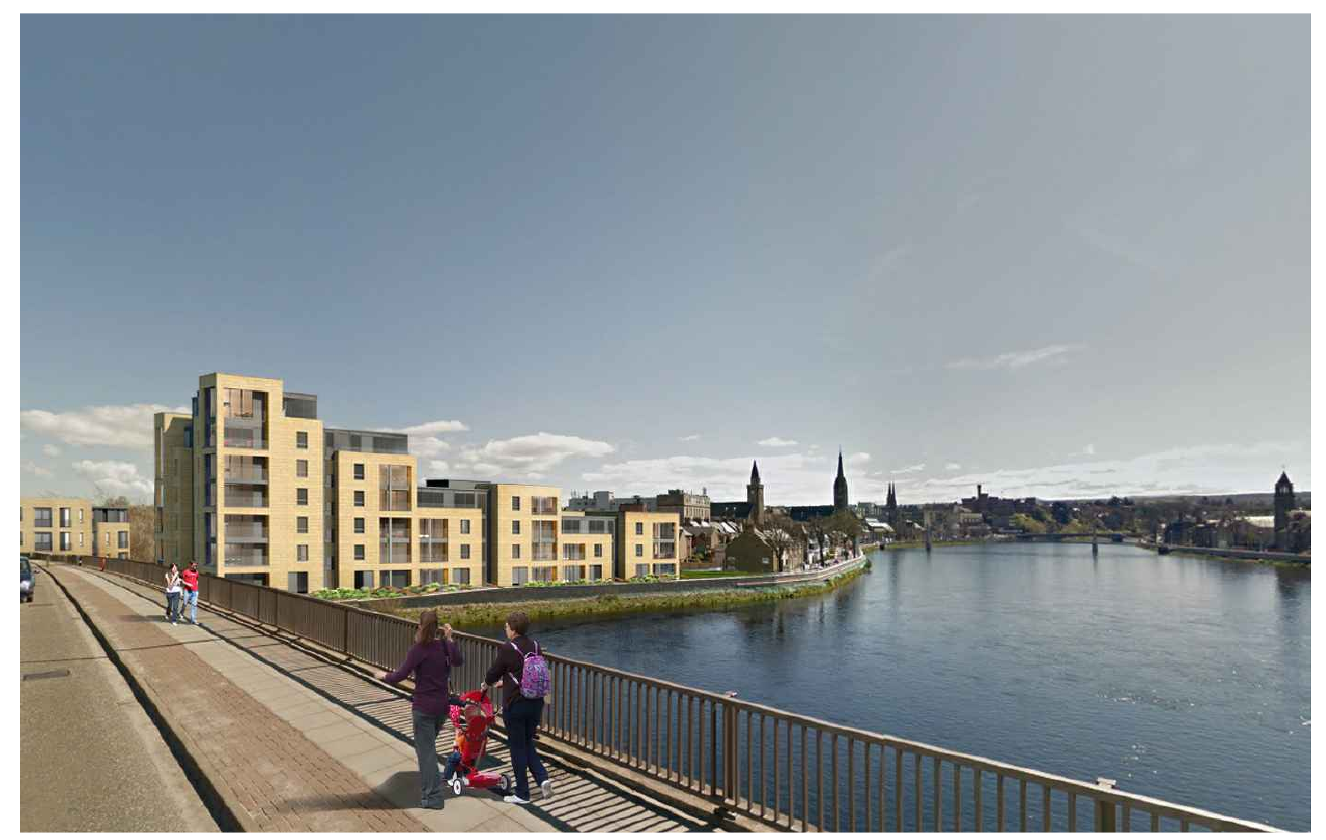
Vertical massing which steps down to relate to low rise buildings on Douglas Row and Glebe Street