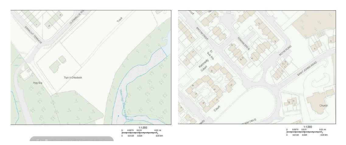
Figure 2: Extent of Existing Development Close to Safeguarded Line for Caol Link Road

3.18. A Caol Link Road would be likely to lever a limited amount of developer contributions. The housing allocation at Caol Lochyside has been subject to developer interest and could deliver around 300 houses. The land north of the Blar Mor Industrial Estate has a permission for business and industrial development. Both of these proposals could reasonably secure the land for the Caol Link Road and possibly secure additional financial contributions towards its construction. However, these contributions would have to be proportionate to the additional burden placed on the road network by these