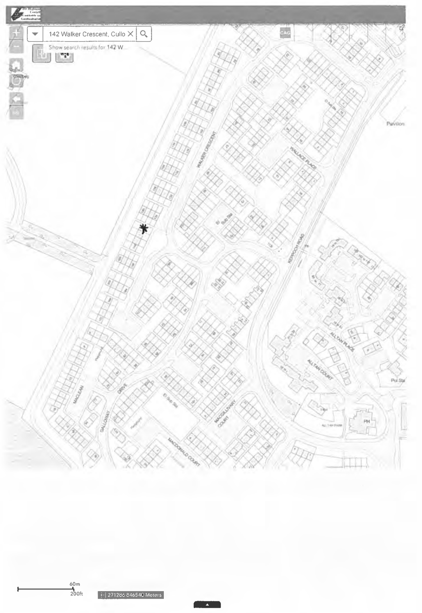
Page 1 of 1 APPENDIX (