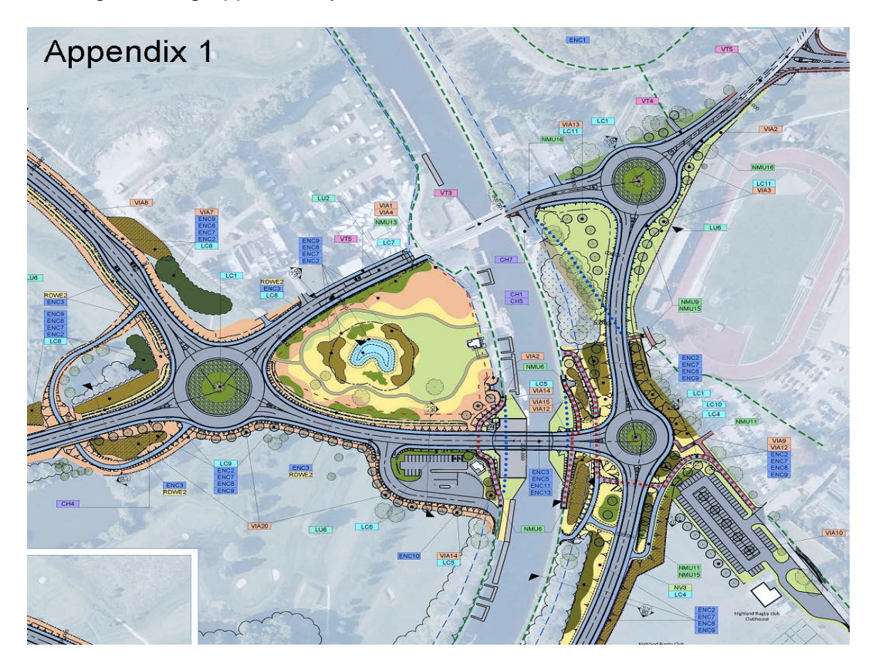
Proposed Planning Application Layout