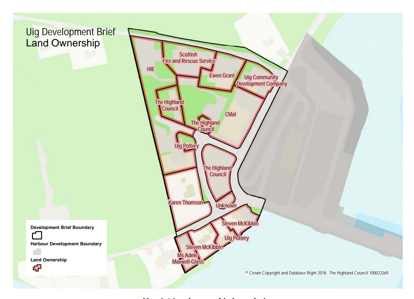
Map 2.1 Land ownership boundaries

There are a number of different landowners within the Development Brief area. As can be seen in Map 2.1 'Land ownership boundaries', large areas of land are owned by public agencies, including Caledonian Maritime Assets Ltd (CMAL), Highland Council, Highlands and Islands Enterprise (HIE) and Scottish Fire and Rescue Service. Whilst this situation has the potential to create opportunities, it also adds a level of complexity to assemble sites for development.