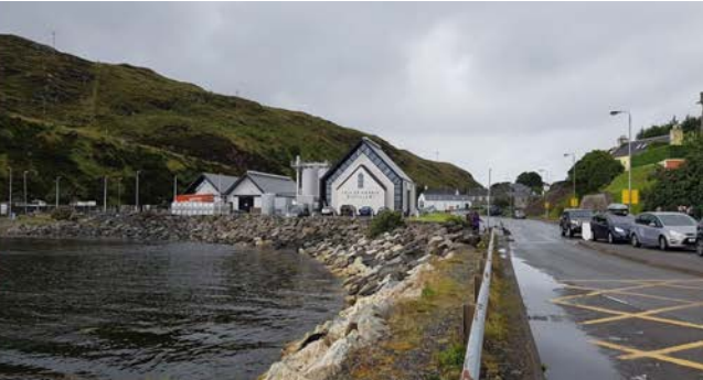
Picture 3.1 Isle of Harris Distillery - an example of a landmark seafront industrial development.