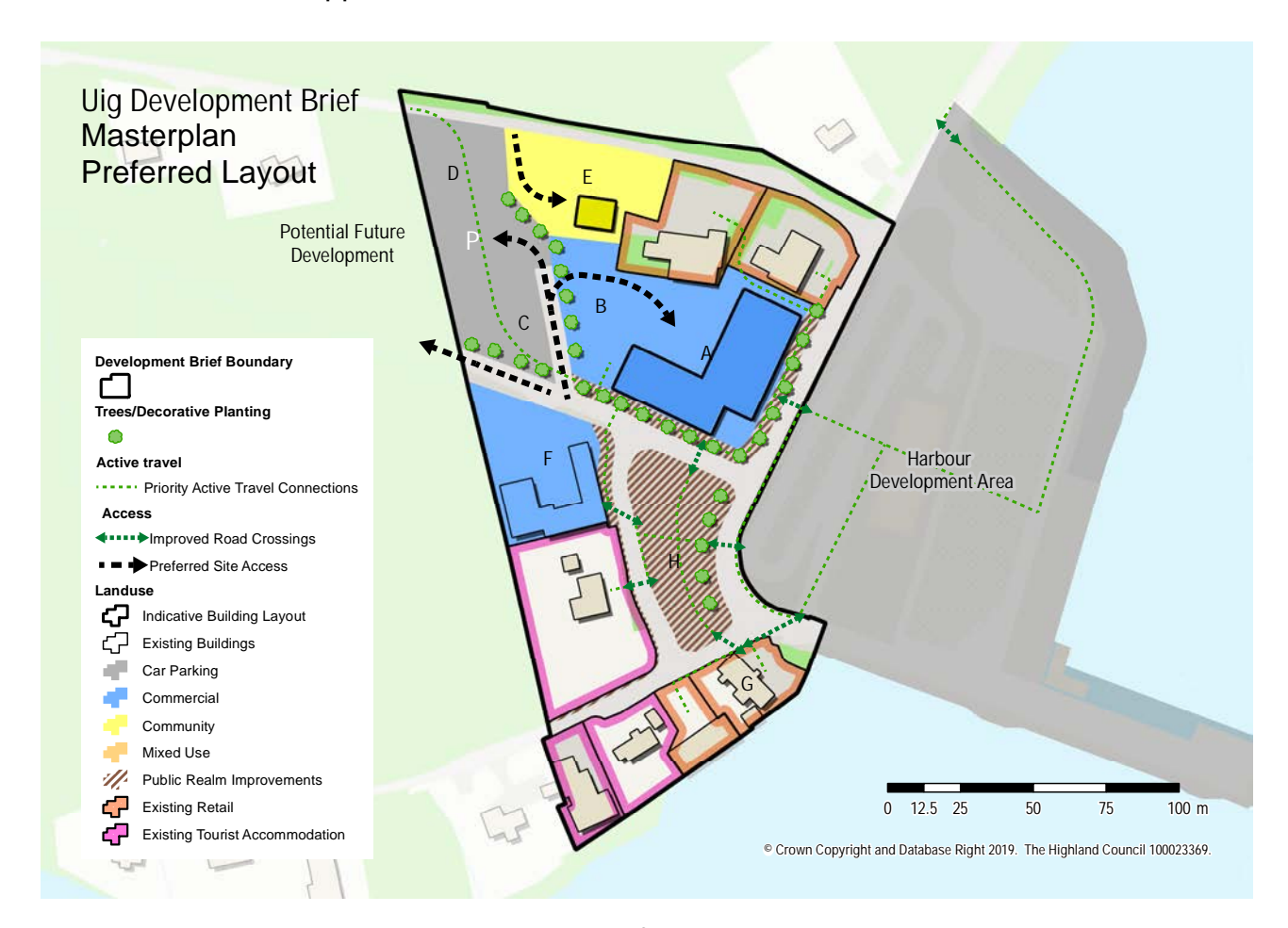
Map 3.1 Preferred Layout

This section sets out indicative masterplans which respond to the Development Objectives above. Sites are labeled A to H which reflect the Key Development Opportunities listed in 'Area Analysis'. Given that the timescales for certain sites becoming available for development and future demands for particular land uses remain uncertain, the Brief sets out both a 'Preferred' and an 'Alternative' layout. This allows for a relatively flexible framework and ensures that the Council can respond to suitable proposals which emerge and a wider range of uses can be supported.