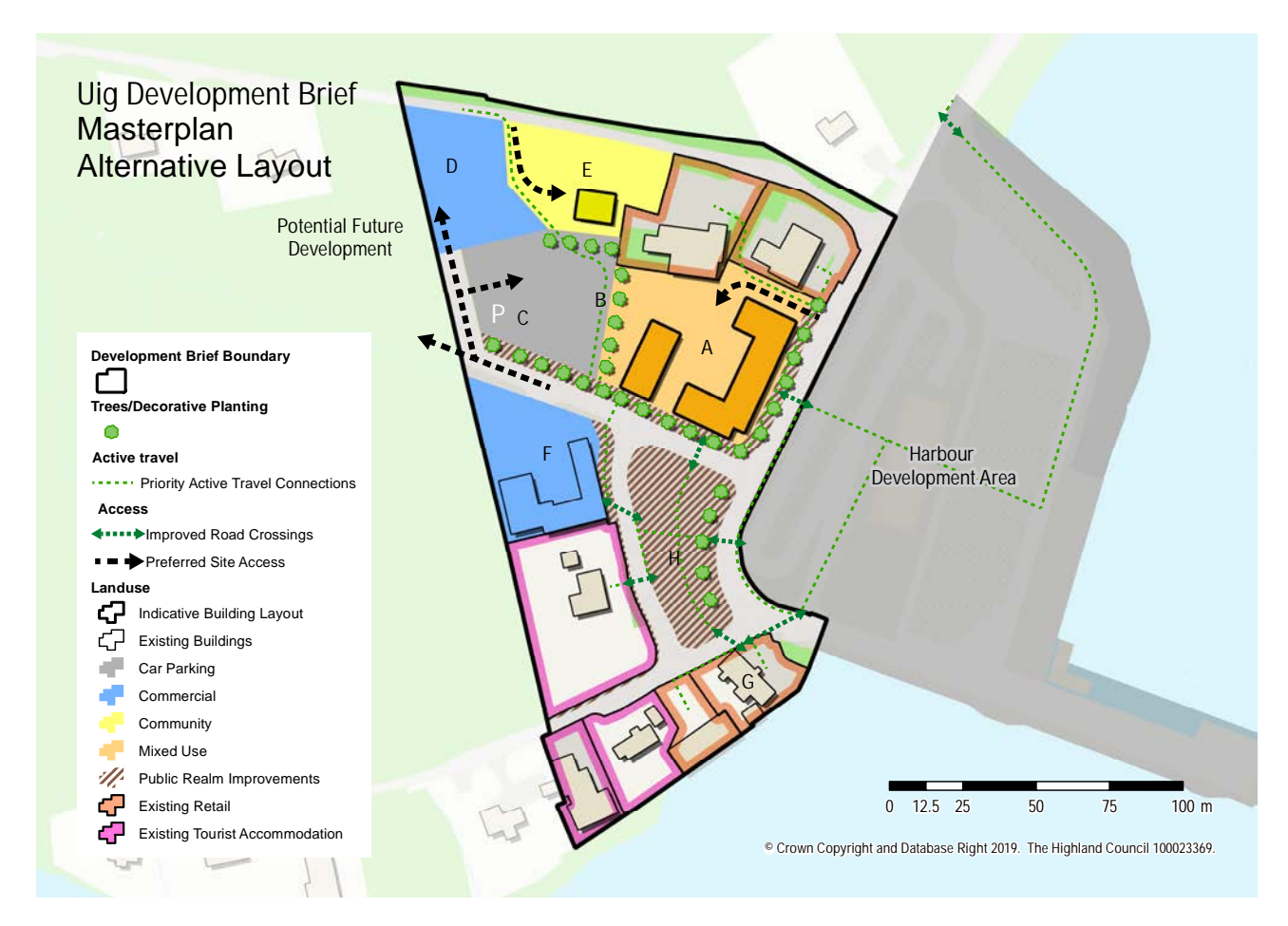
Map 3.2 Alternative Layout

Alternative Layout: Mixture of retail/tourism uses (Classes 1 and 3) on ground floor with residential (Class 9) component facing seafront.