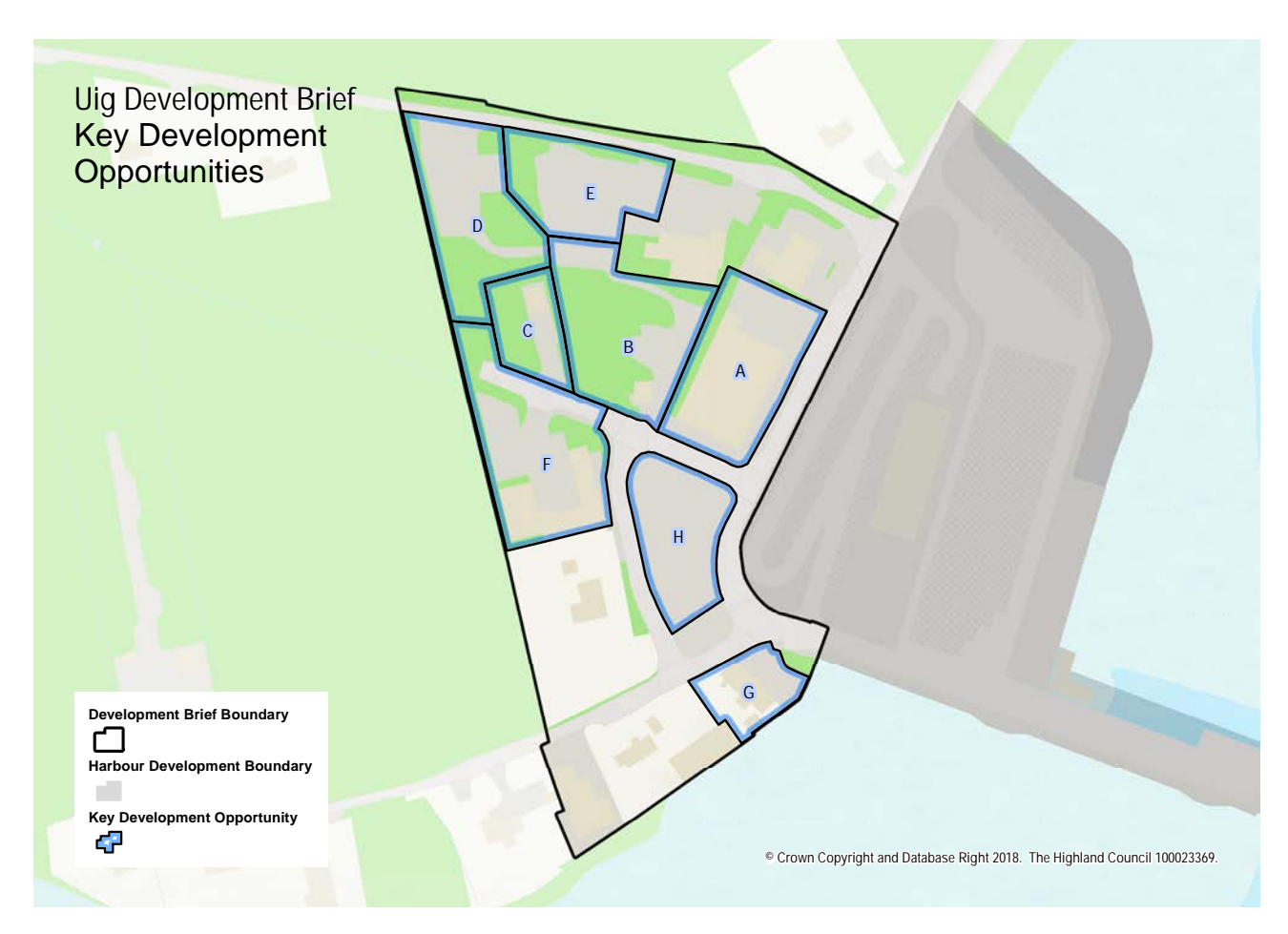
Map 2.2 Key development opportunities

17 Whilst each of these sites have been promoted for development, the Council would welcome proposals to come forward on other sites that help to deliver the aims and aspirations set out in the Development Brief.