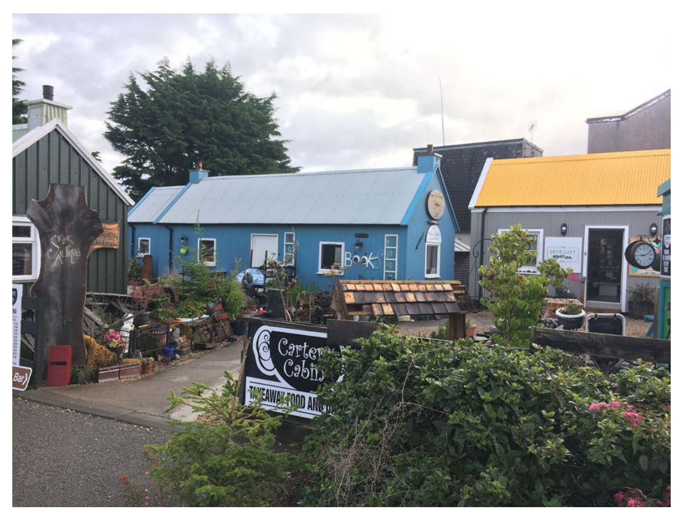
Picture 3.2 Broadford's 'Market Square' - An example of a cluster of small retail units