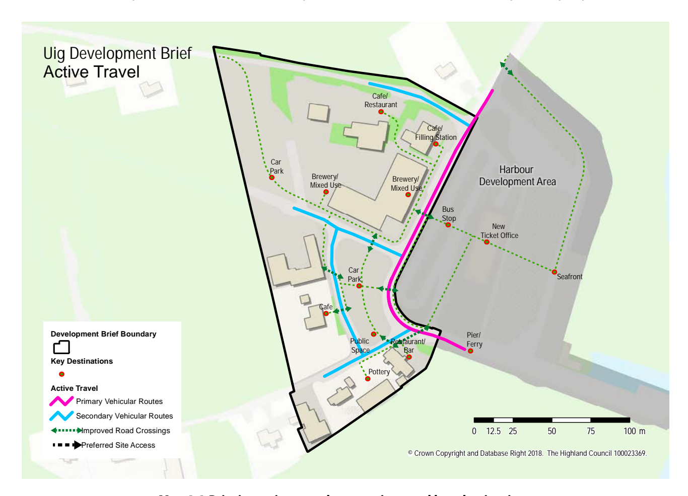
Map 3.3 Priority active travel connections and key destinations

pavements to the streetscaping and pedestrian links, such as creating a designated pavement and relocating commercial waste bins from the public pavement, along the road to the campsite should also be incorporated within relevant development proposals.