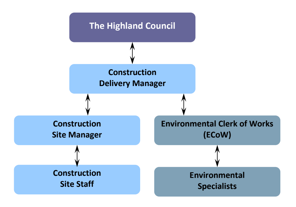
Figure 3.1: Organogram