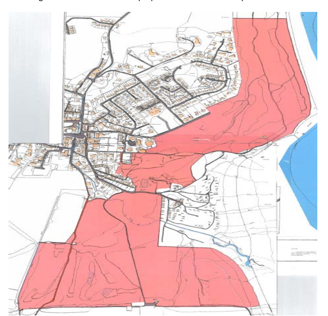
<u>Image 1</u> This image shows the full area now proposed to be leased to Royal Dornoch Golf Club

RDGC will be covering the costs of the changed layout to the land in the area highlighted in image 2 and have also agreed to fund the construction of a new sports facility at Dornoch Academy campus subject to a cap of £100,000.