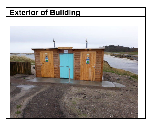
£100 a month, example 2: