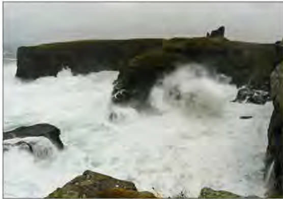
Stormy weather at the Castle of Old Wick. Historic Environment Scotland says historic properties 'face a constant battle against time and the elements'.

HES, which looks after 336 historic attractions, described the programme as "a proactive step towards transforming the way the nation's most precious places are protected, repaired and experienced in the face of accelerating decay from climate change".