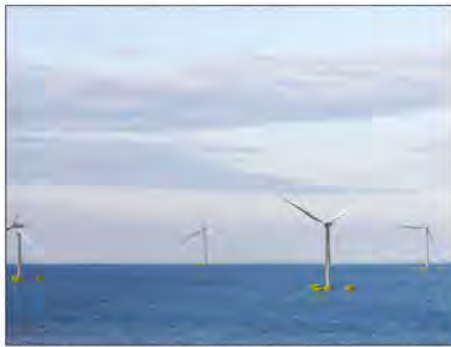
Pentland Demo will support the development of innovative, UK-manufactured floating wind technologies.

The Floating Offshore Wind (FOW) Demonstration Programme funding has been provided through the Net Zero Innovation