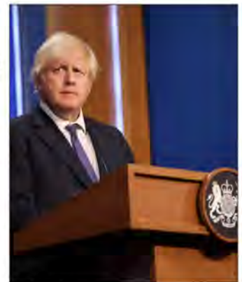
PM Boris Johnson is in trouble.

Integrity is defined as the quality of being honest, with strong moral principles