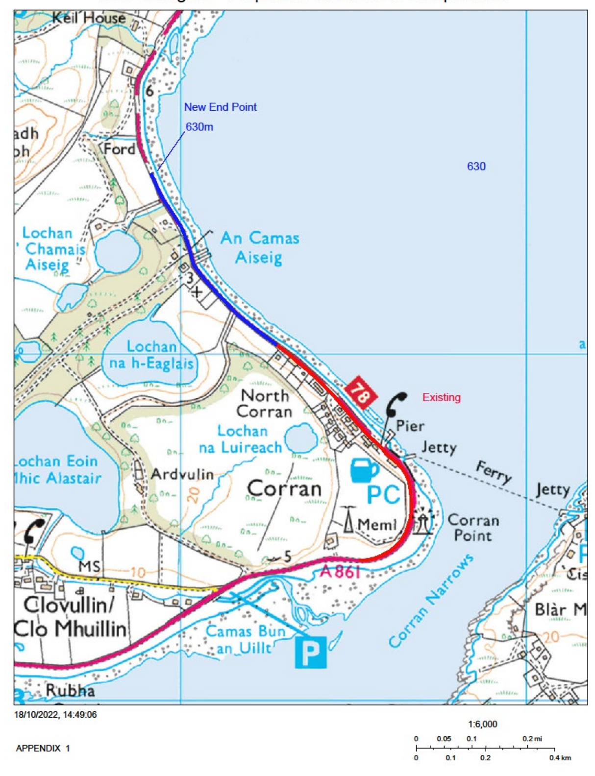
A861 Ardgour - Proposed Extension to 30mph Limit