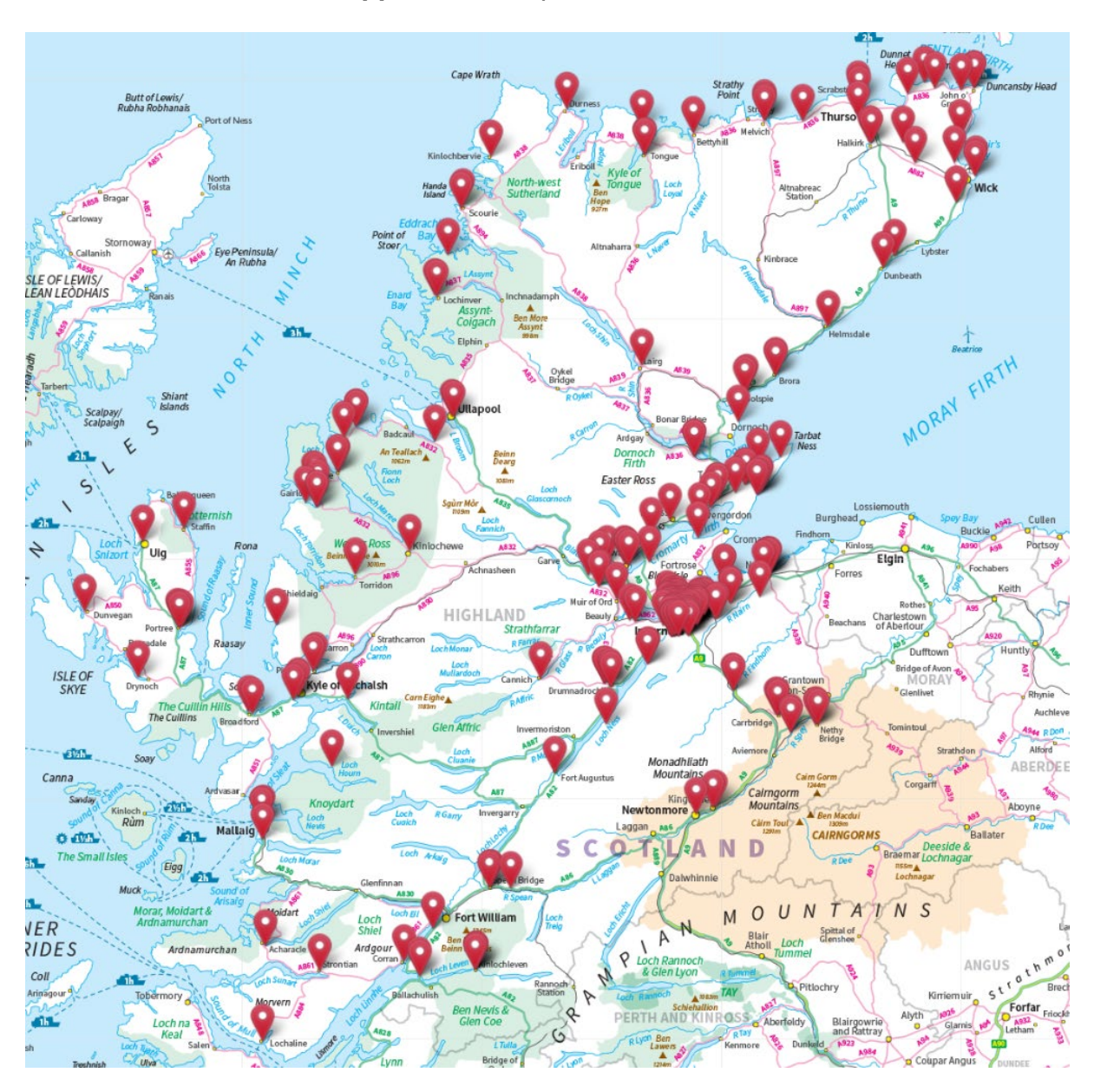
Appendix 4 – Speed Count Sites