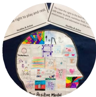
Understanding and engaging with My Rights

We have a range of universal learning resources that support children to develop their own emotional literacy.