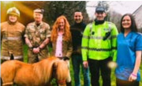
Super Hero Day