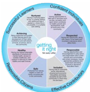
Empowering children and young people