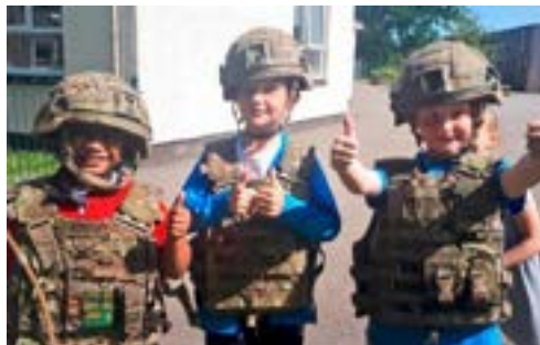
Armed Forces Day, Raigmore Primary