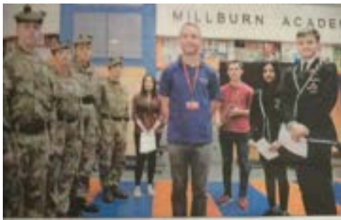
Lest we forget. Armistice Day