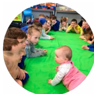
Understanding and developing Empathy