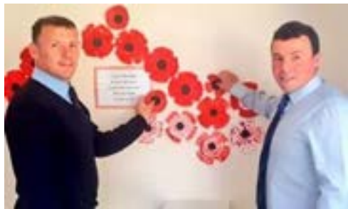
Raigmore Primary School