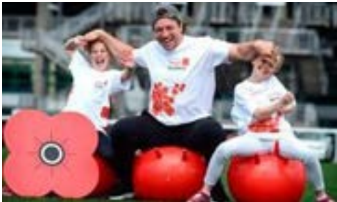
Big Poppy Bounce 2019