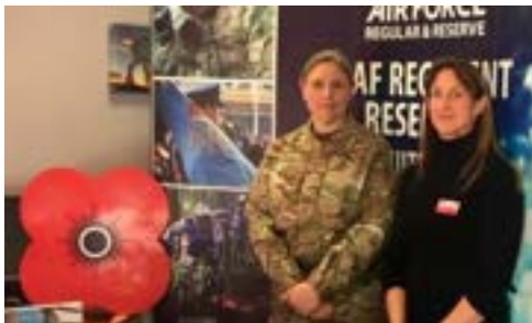
Armed Forces and Reservists Day