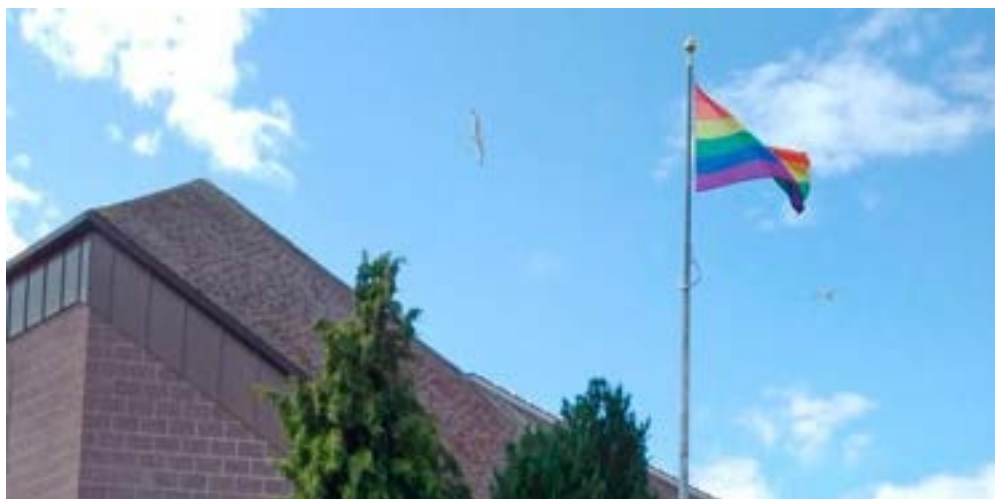
Raising the flag at Highland Council supporting diversity and inclusion