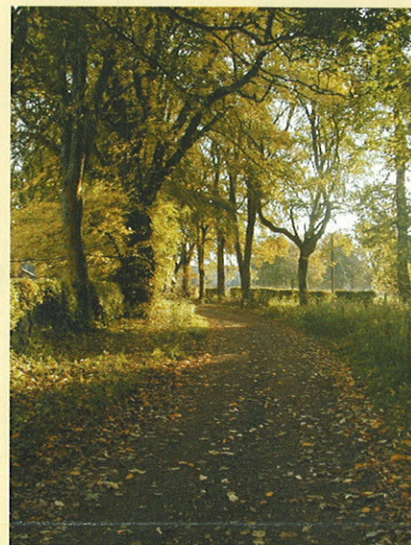
Rosehaugh, South Drive

From the Station Hotel walk up School Brae, signposted for Killen, until the road turns sharply right and up hill. From here continue straight on past Fletcher Gardens before the road narrows and enters the estate. This track is known as the South Drive and winds past old dykes and avenues of mature trees. Shortly after passing farm buildings follow way markers to take a tarmac road up past the Estate Office. Continue past the estate buildings through more mature trees to the kennels.