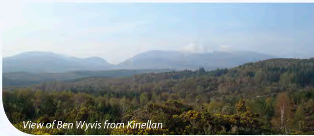
View of Ben Wyvis from Kinellan