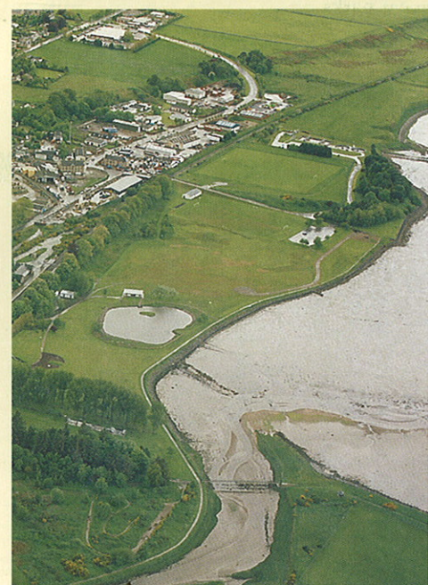
Links from the air