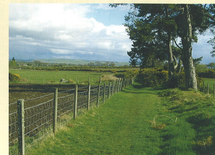
Moss Road Circular

NB There is no parking provision at either end of the path between the Quarry Road and Moss Road.